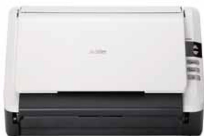
Input and output paper tray can be fold when not in use.