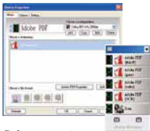
The Button manager main screen

Avision's state-of-the-art software application, the Button Manager, enables you to complete complex scanning task in just a single step. When the button is pressed, the scanner automatically scan your documents and convert them to a highly compressed file format, Adobe searchable PDF, or other image format and then send the file to a designated folder, or other destination applications such as e-mail, printer, or your favorable software application. The original step-by-step procedure is replaced with only a single touch of the button.