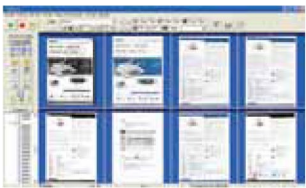
The AvScan 5.0 main screen

-The Intelligent Document Management Tool